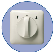
Supplied with concealed rotary switch