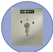
Optional key-operated switch