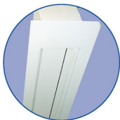
NEW! Screen surface sits exactly in the casing thanks to a circular weight slot

This set allows the screen to be mounted into suspended ceilings (up to 100 cm) Code No. 8585WW1038