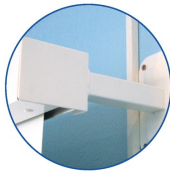
Suspended ceilings 15/30/50 cm Code No. 8585WW1038